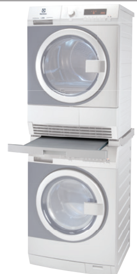
Example of Stacking kit open